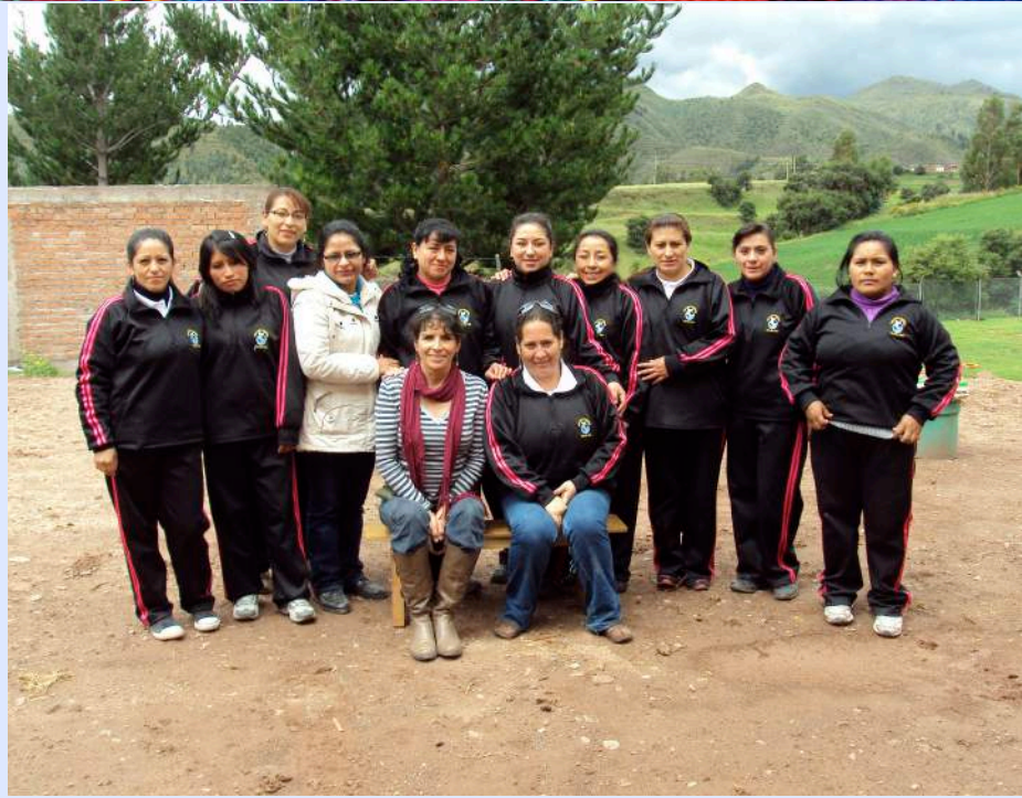
The CW staff; our 8 teachers, 2 cooks, 1 secretary and Administration.

Chicuchas Wasi School for Girls provides quality primary education and promotes gender equality, self-esteem, and human dignity for the marginalized indigenous girls of rural Cusco, Peru. With the CW education and skills the girls are empowered to become economically independent. They become important role models and leaders for the next generation of CW students. Our parent classes focus on helping the students family to understand the value of educating their daughters. The importance of family support is emphasized and families learn more effective communication skills that help to deter domestic violence against women and girls.