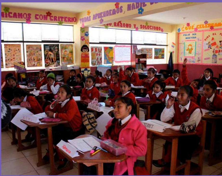
Class is in session and all are paying attention.