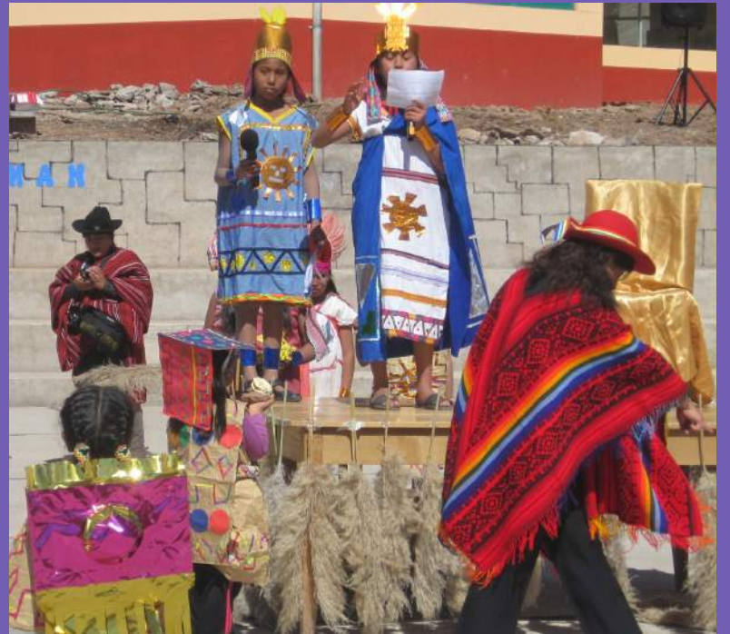
CW students learn history by creating a theatrical presentation to honor the Inca History during Inti Raymi. Students made all costumes, researched the history and created the play.