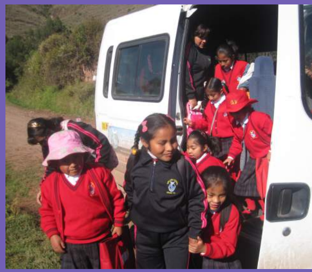
CW school van is tired but without it... no class that day