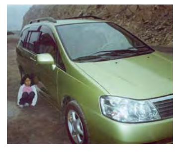
A visit from a Chicuchas Wasi supporter makes for an exciting day!