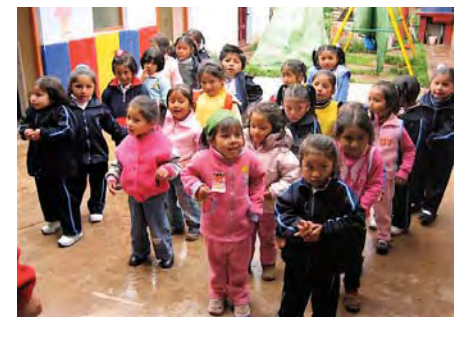
Students in uniforms pose for a photo with visiting Chicuchas Wasi supporters