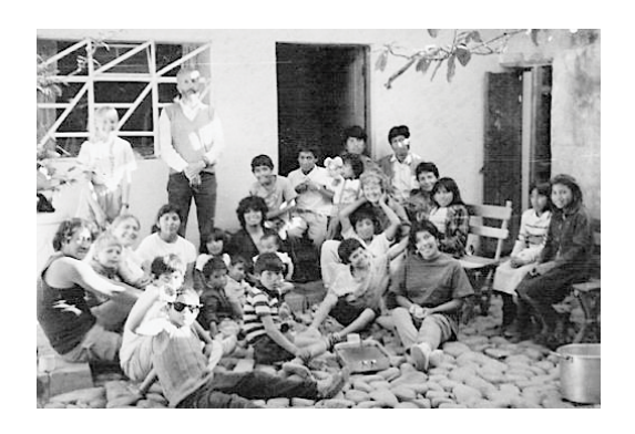
...serving the needy and abandoned children in Cusco, Peru