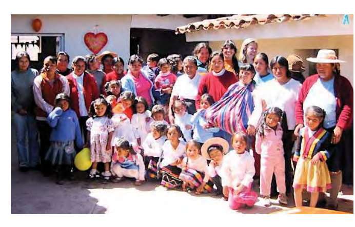
Class of 2006