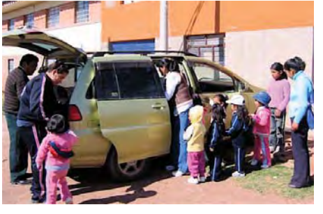
Our new van at work!