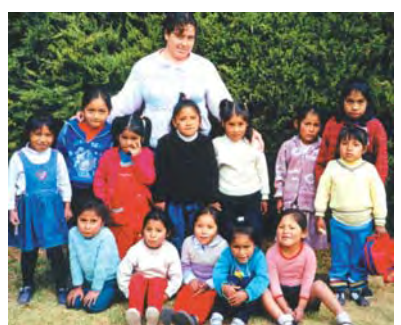
Class of 1999